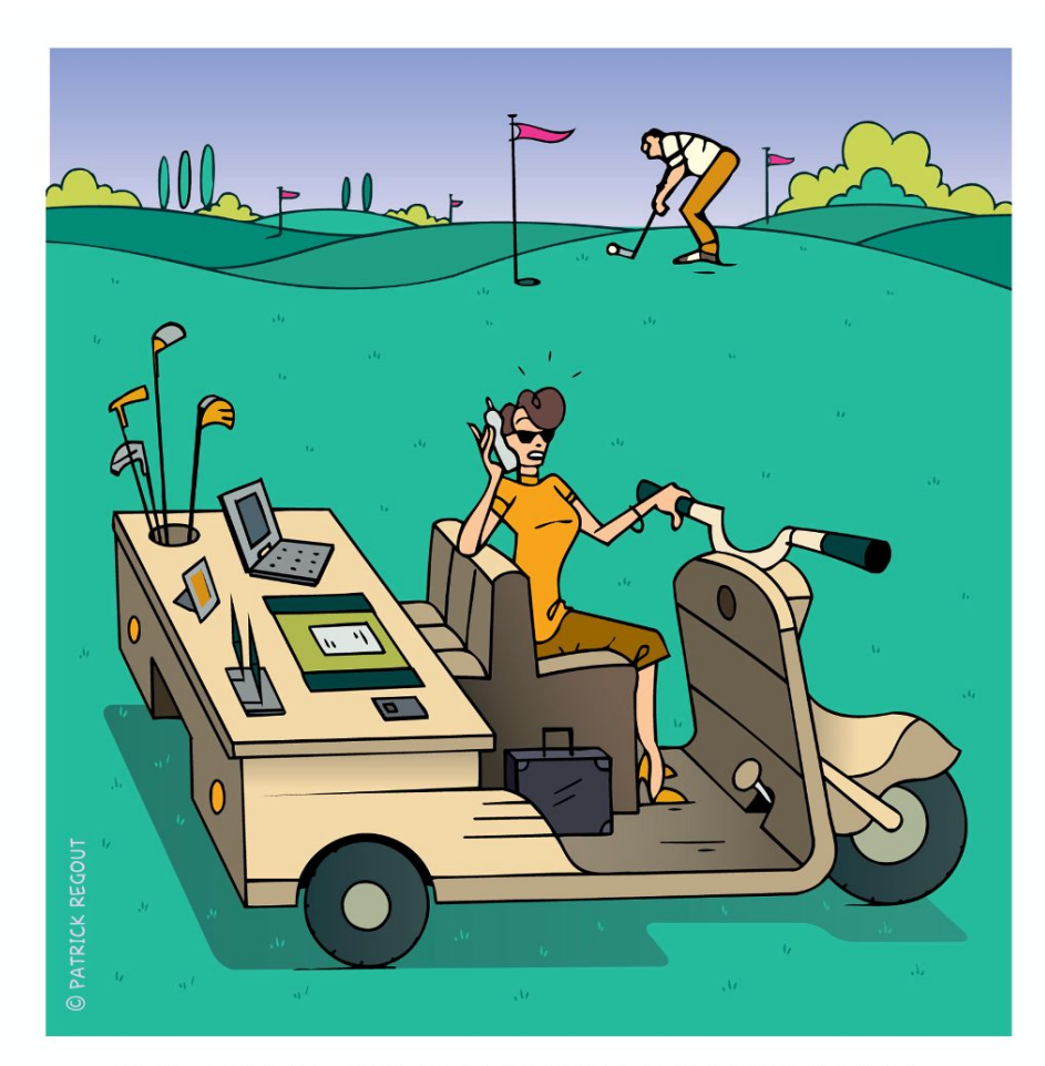
"I'M SORRY, MR JONES HAS JUST STEPPED AWAY FROM HIS DESK."