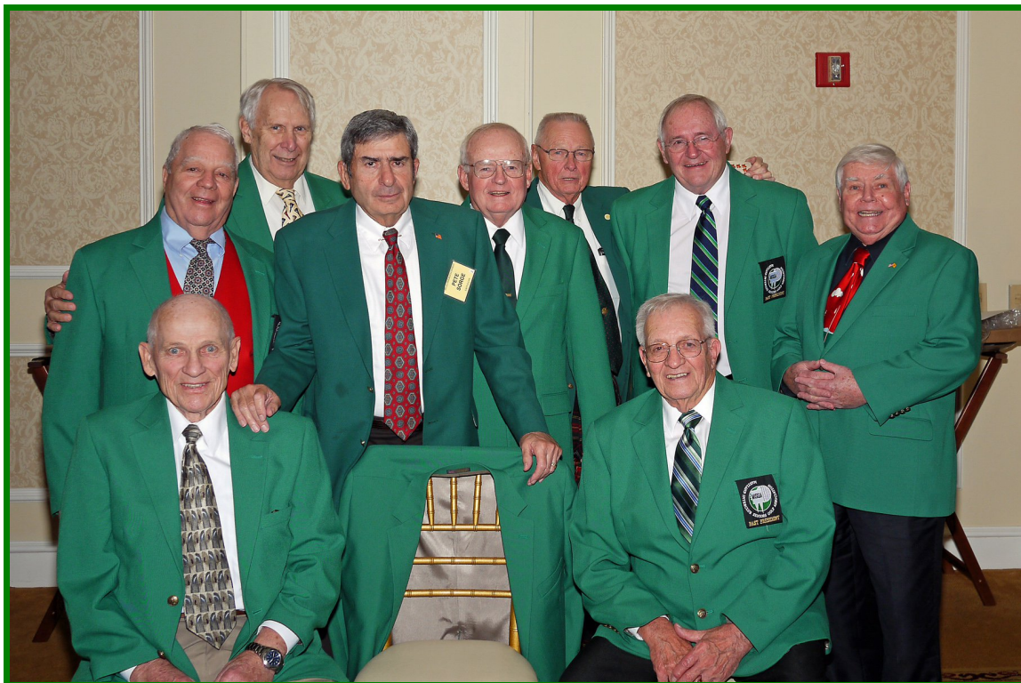
Other Past Green Jacket Awardees Attending