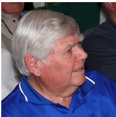
Milford, NH?! That's my hometown!

For something different today, a two fold purpose, hopefully to stimulate your interest in accepting more organizational responsibility and giving beyond the norms of your talents to MISGA, and to recognize one in attendance.