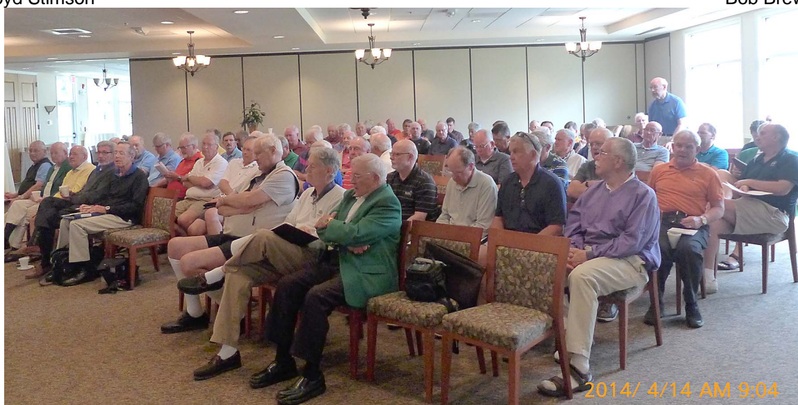
MISGA Representatives - In Session