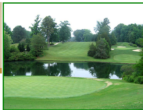
Gold Course #2