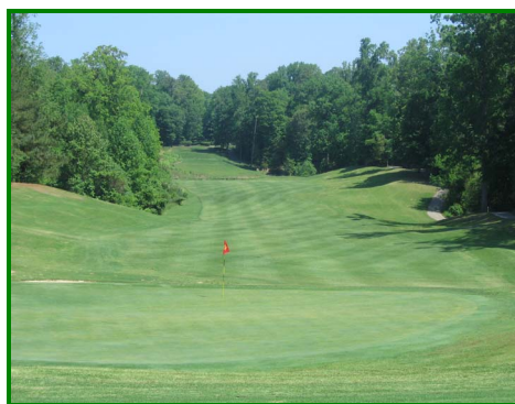
Green Course #18