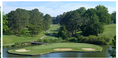
Gold Course #16