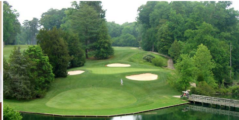
Gold Course #7