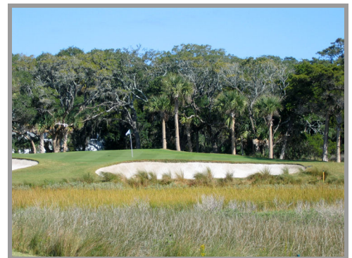
Ocean Winds Hole #15 Par 3