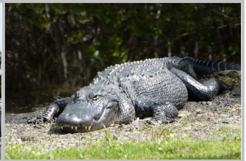
Small Lizard, but larger than a Gecko!

[ZOOM FOR LARGER PICTURES – 300 to 400 %, and even 500%]