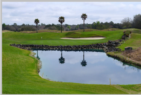
Twisted Oaks G. C.