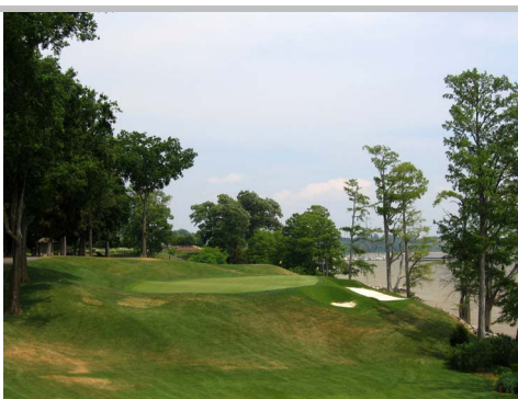
Kingsmill – River #17