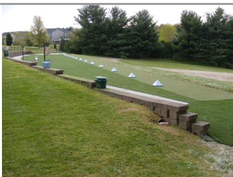
New Practice Range