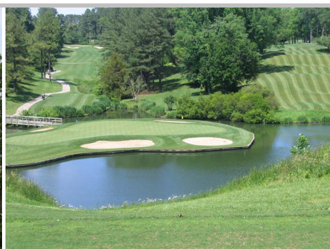
Golden Horseshoe – Gold #16

[ZOOM FOR LARGER PICTURES – 300 to 400 %]