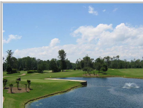
Kingsmill – Woods #9