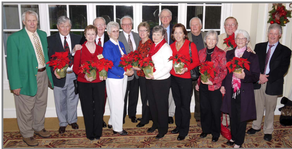
Hobbits Glen Group at Manor Christmas Party, 12/15/2011