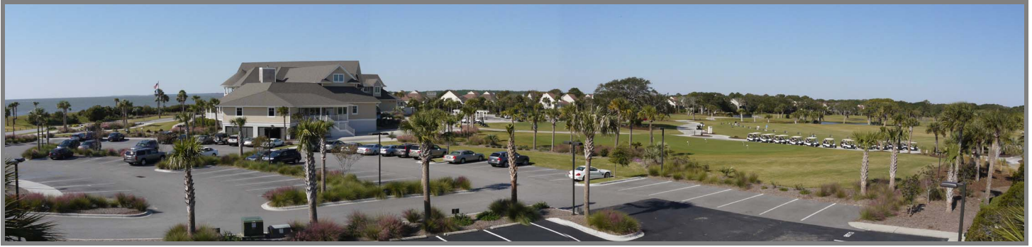
Clubhouse & Driving Range [ZOOM FOR LARGER PICTURES – 300 to 400 %]