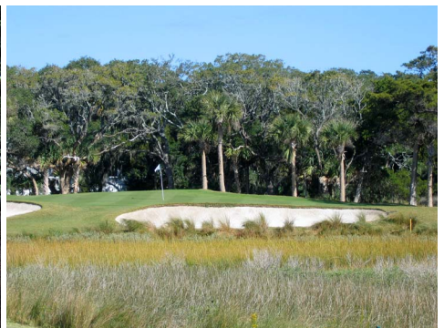
Ocean Winds #15