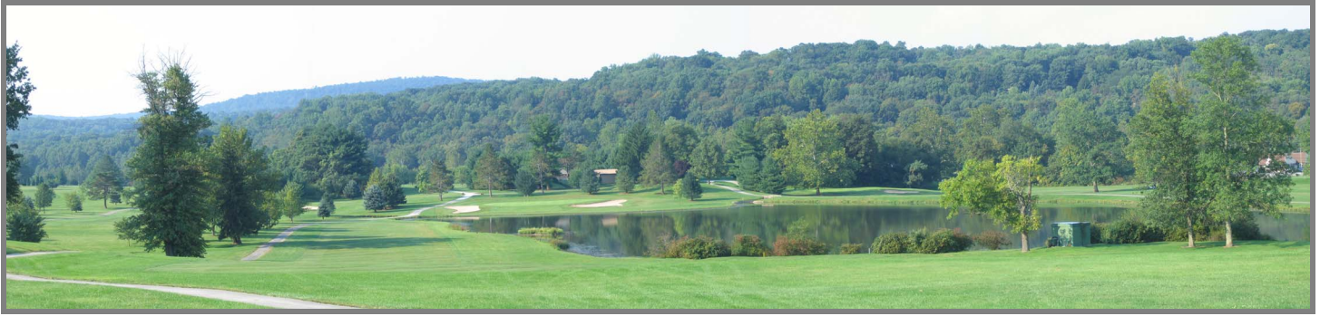
Carroll Valley No. 10

[ZOOM FOR LARGER PICTURES – 300 to 400 %]