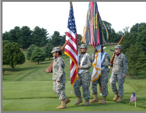
Color Guard at 10th Tee