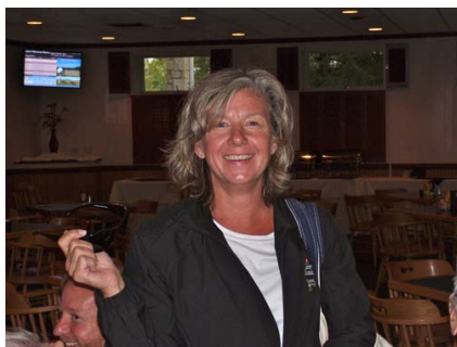
The Cart Person