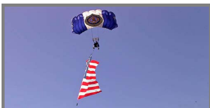
Double Leg Amputee Jumper