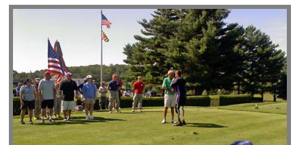
Jumper on 10th Tee