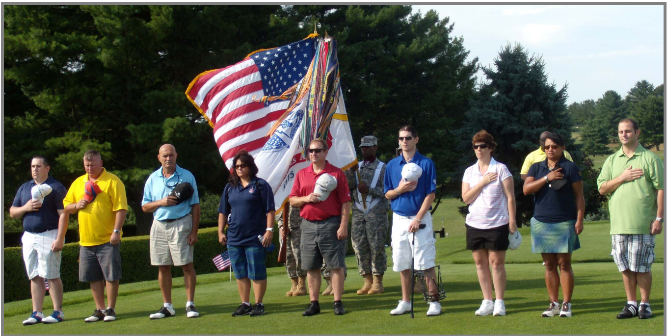
Wounded Warriors at 10th Tee

The Walter Reed Society established a fund in 2004 to assist servicemen and women being treated at Walter Reed Army Medical Center, due to service in Iraq, Afghanistan and surrounding areas, with unexpected financial needs and provide specially identified equipment and services related to their care when other resources are not available. Since its inception, hundreds of service members and/or their families have received assistance from the WRS Warrior/Family Support Fund. The total amount granted exceeds $1.5 million.