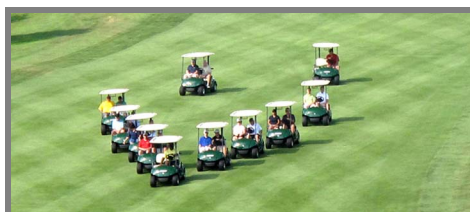
V-Formation Golf Carts