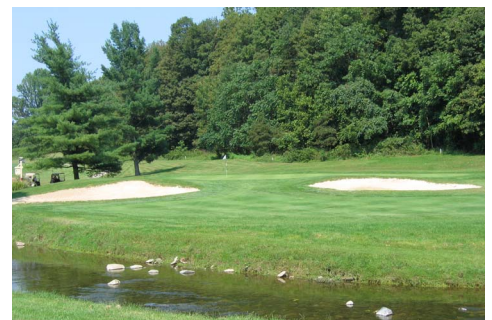
CV No. 14