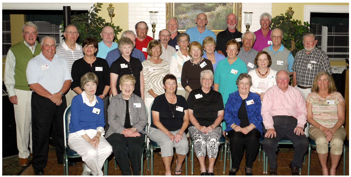
OCEAN PINES (29)