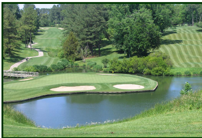
Golden Horseshoe #16

The 2011 Spring Fling will again be held in Colonial Williamsburg, Virginia which is located about 2.5 to 3 hours south of Washington, DC. This will be our fourth consecutive year in Williamsburg. (So many golf courses and so little time!) Each year the weather has been ideal with temperatures in the 70's in the daytime and mid 60's at night. It is a prime time! That fact combined with the excellent golf courses makes Williamsburg an irresistible place in mid-May. We will be playing three different golf courses: The Woods Course at Kingsmill, the Gold Course at Golden Horseshoe, and the Black Heath Course at Fords Colony. Two of these courses are being played for the first time in the Spring Fling and the third course, the Gold course, we will return to for the first time in four years. (Everyone should play the Gold course one time, even if not a part of a MISGA event. The current rack rate at the Gold course is $165.) Four years ago we did not know how many participants we would have. Consequently, we assigned the ladies to the Green Course. In order to insure that the ladies get to play the Gold course this time, participation will be limited to 120 golfers. Flyer and Entry Form are available at http://www.misga.org/Entry_Forms/spring2011.pdf on the MISGA we site.