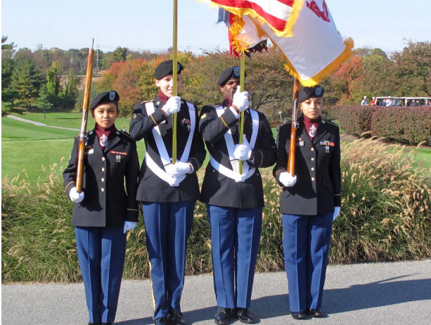
IHOOT HONOR GUARD