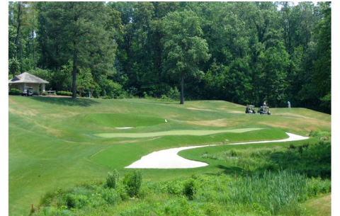
River Course - #13