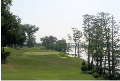
River #17 Tee view

The Spring Fling at Williamsburg, VA was attended by 76 golfers, including spouses. There were also several non-golfers. The weather was generally good - cold and windy on Tuesday, hot on Wednesday, and cool on Thursday.