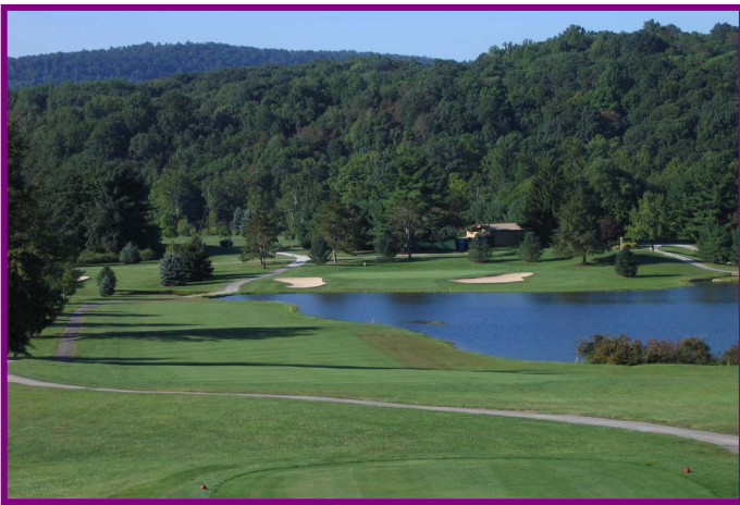
The Scenic Par 4 10th at Carroll Valley Strategy for Playing #10

Remember, August 7th is the deadline, so get your entry in early while there are still openings.