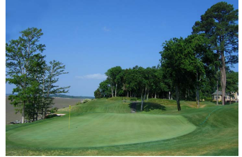
River #17 Green view