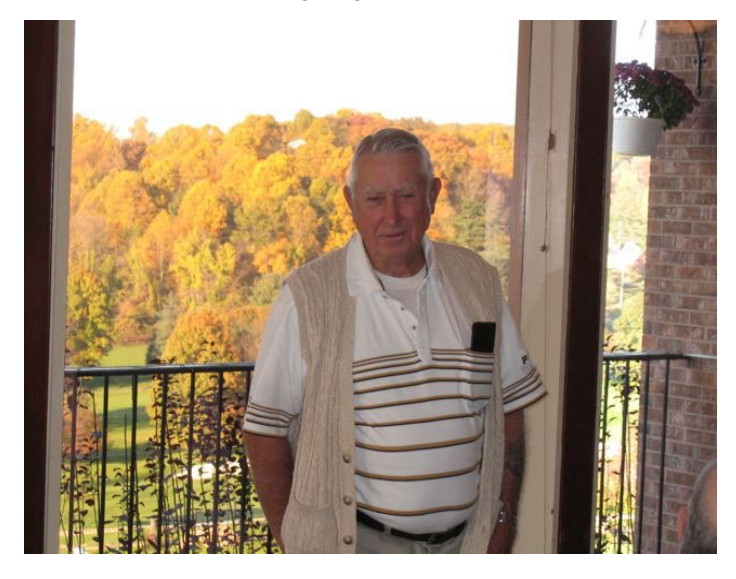
If I won all of that in one day I'd be smiling too!