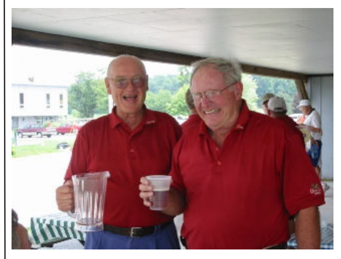
Who says that MISGA is all golf and no fun?

Some times it just doesn't pay to play, but then the beer seems to help change your mind.