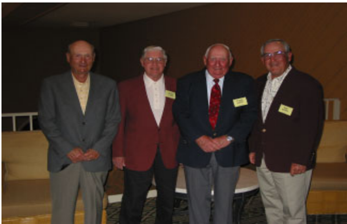
Second Place Jekyll