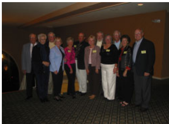
Maple Dale Group at Jekyll