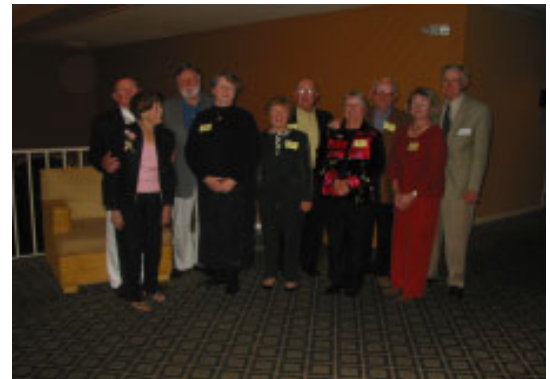
Walden Group at Jekyll