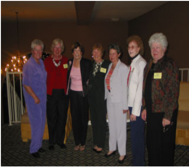
Nine Hole ladies at Jekyll Island