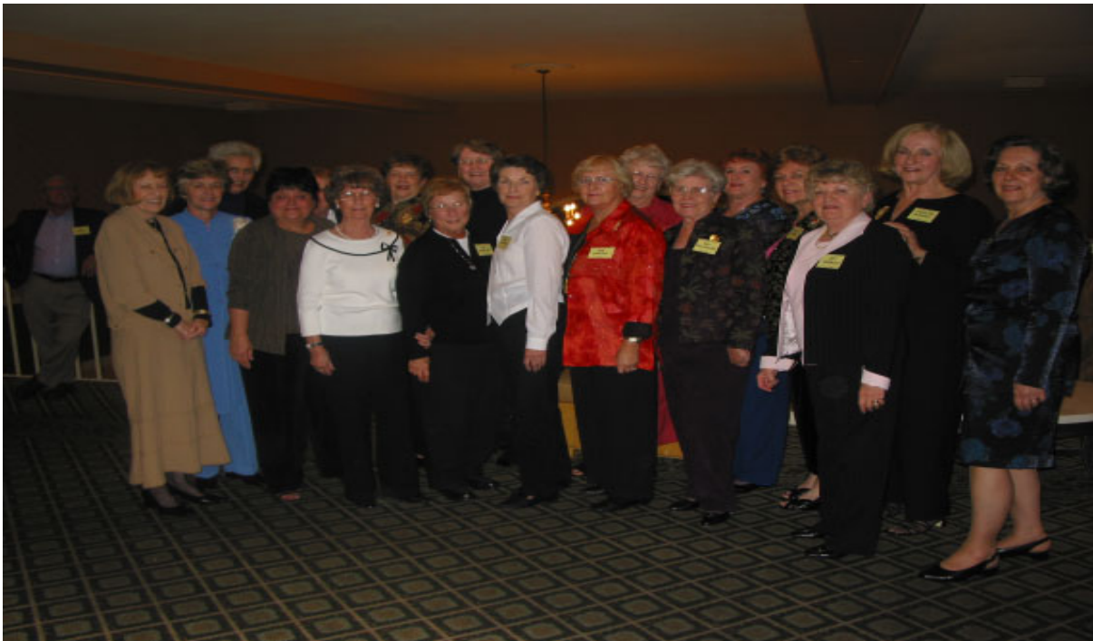
Non Golfing Ladies at Jekyll Island