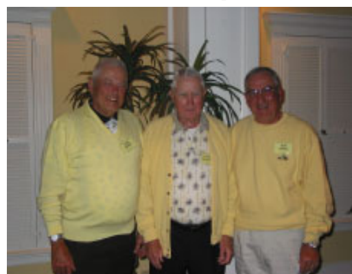
Second Place at Jekyll