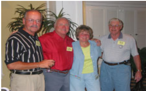
1st place scramble team at Fripp