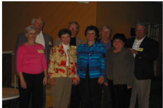
Hobbits at Jekyll