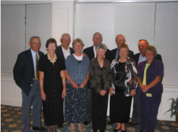
Division 11 couples at Jekyll