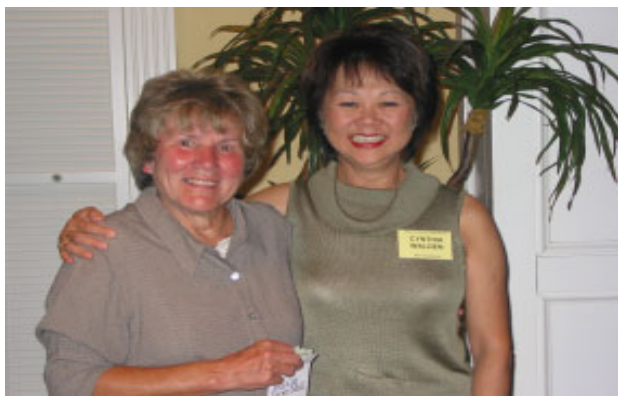
Look at what that Georgia sun will do to you