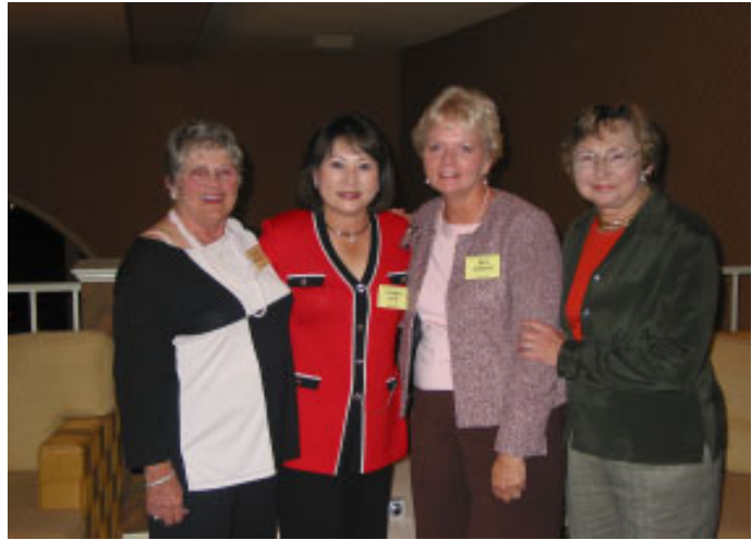
1st place winners at Jekyll