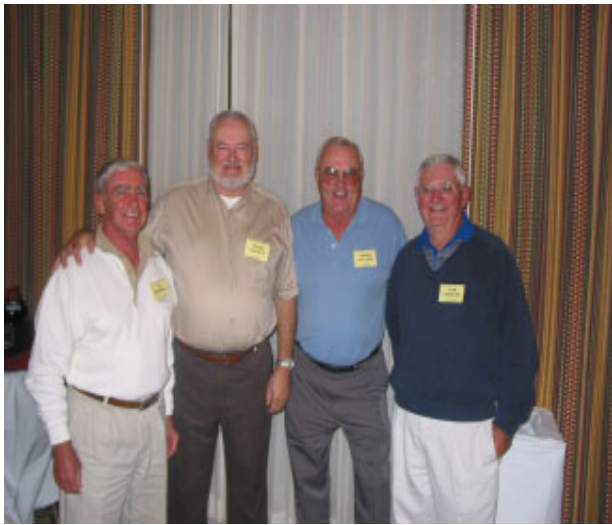
1st place winners at Jekyll