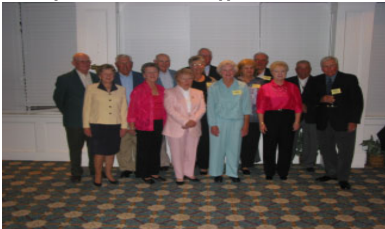
Harbour Towne Group at Fripp