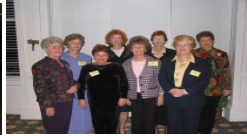
Fripp Island Non-Golfing Ladies