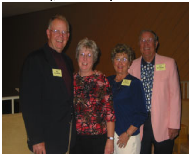
The Tilghmans and Gladdens at Jekyll Island