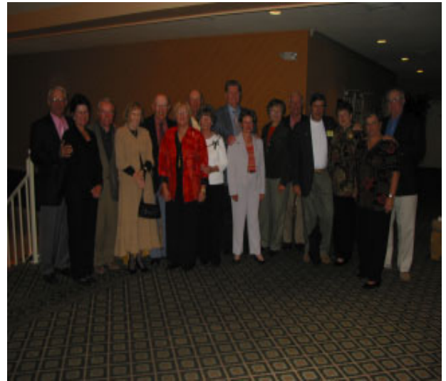
Tantallon Group at Jekyll Island