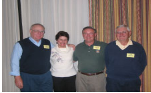
1st Place Scramble team Jekyll