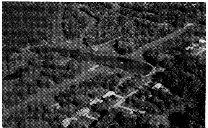
Garrison Lake Golf Club